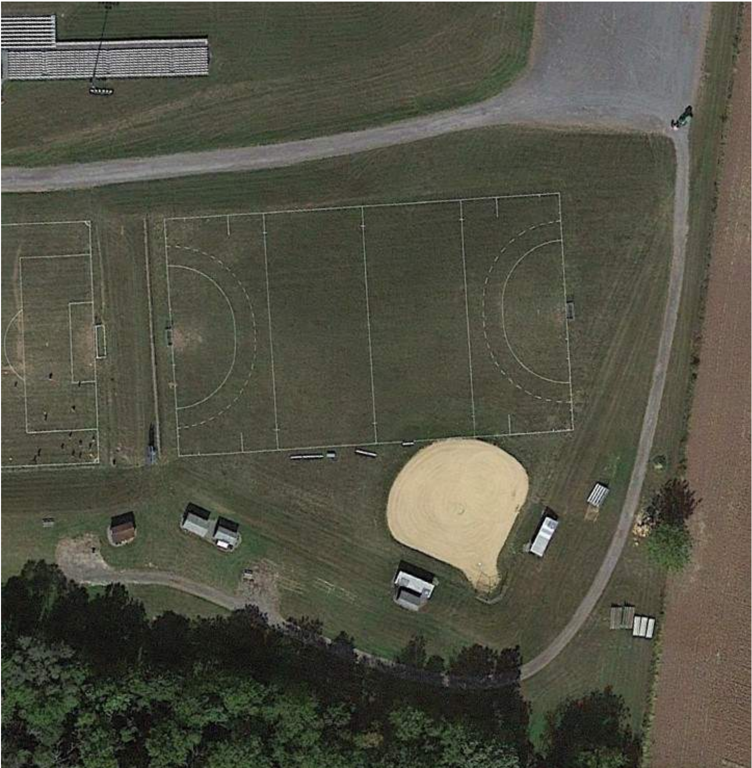
Softball / Field Hockey Field