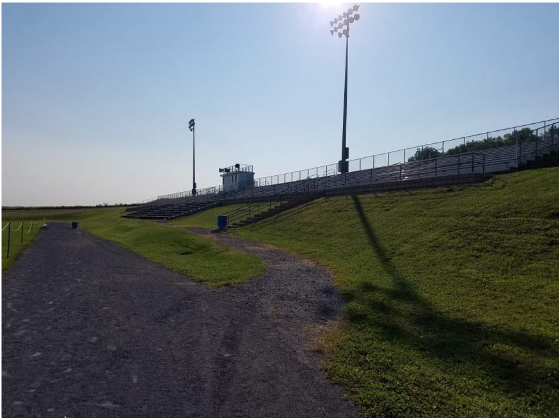
Figure 4: Home bleachers and stone access walk