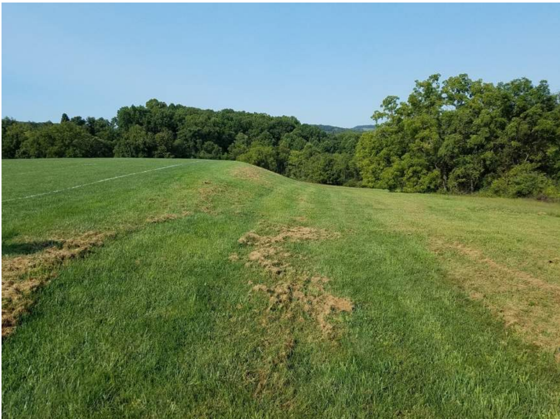
Figure 12: North side sloped embankment