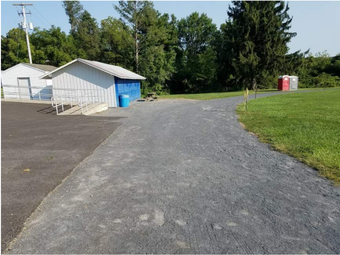
Figure 3: Cinder oval and concessions building