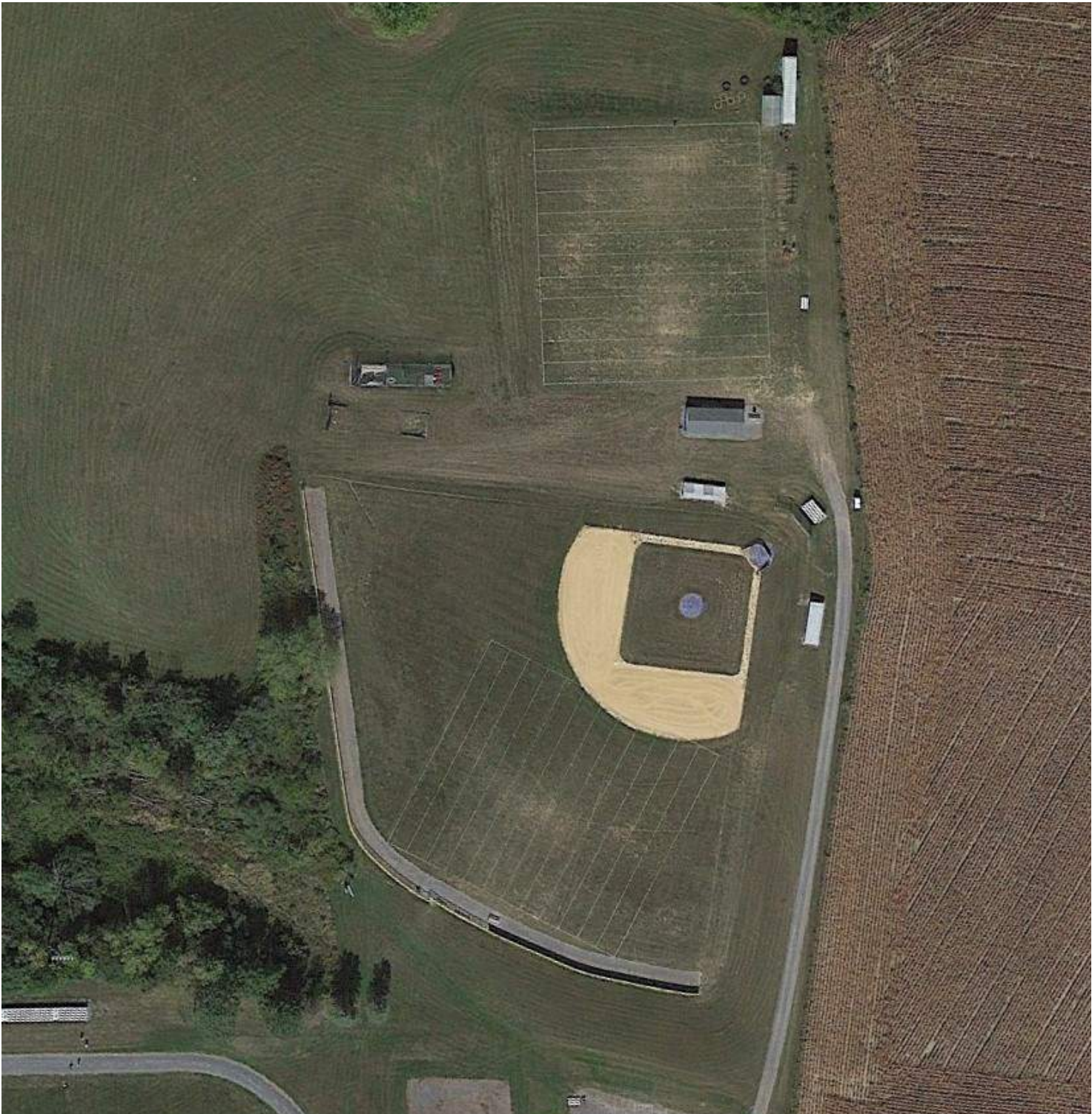
Baseball Field and Football Practice Field