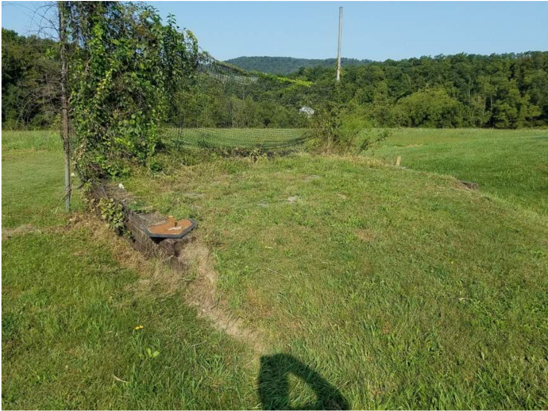
Figure 7: Bullpen condition