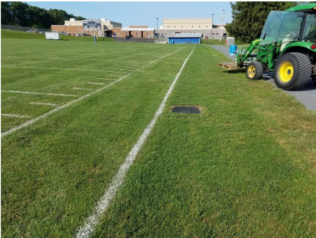
Figure 8: Close proximity of drainage structures to sideline