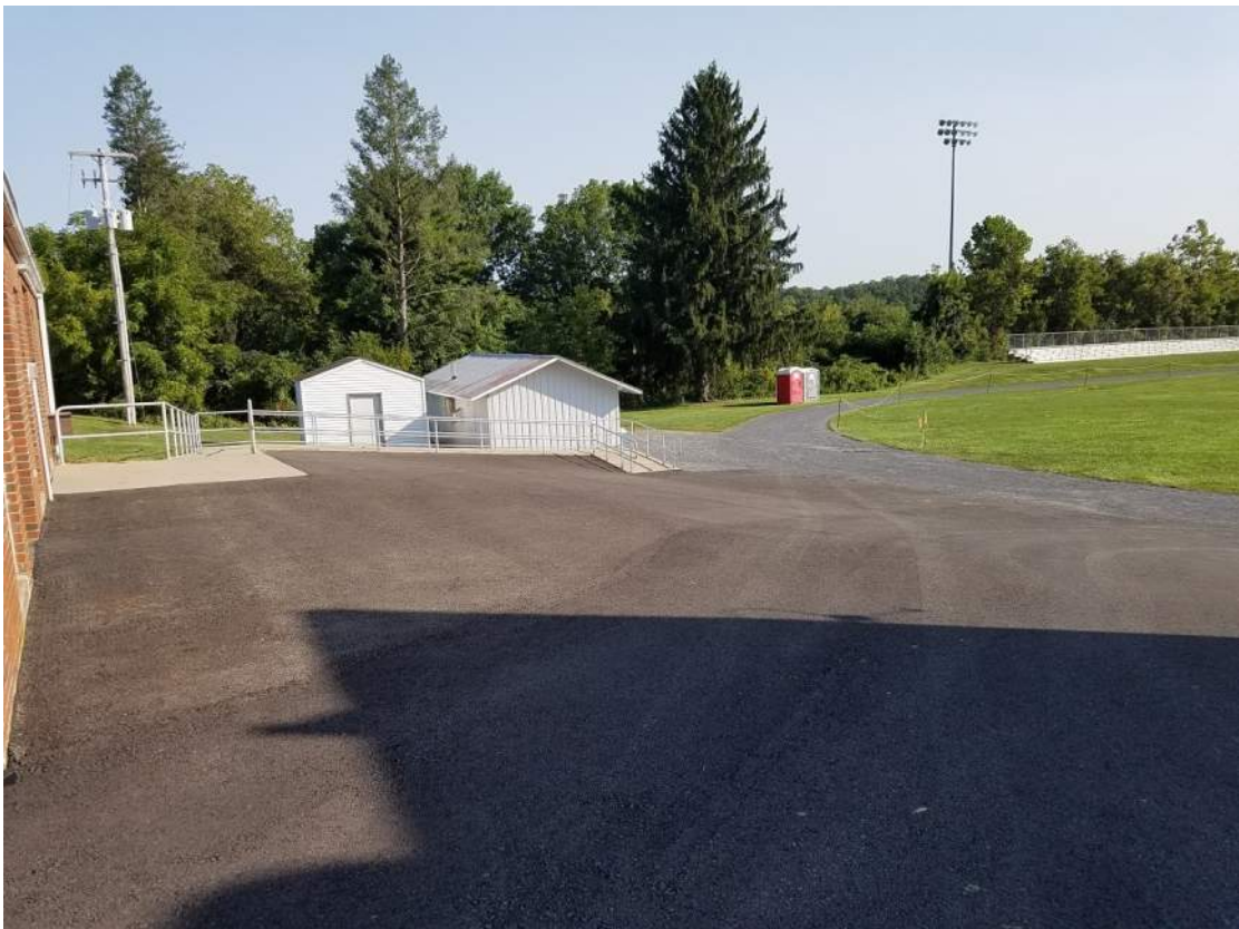
Figure 2: Sloped asphalt entry apron and ADA ramp