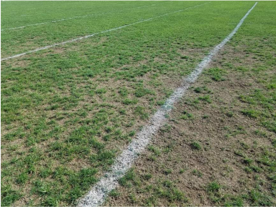
Figure 11: Practice field—general lawn condition