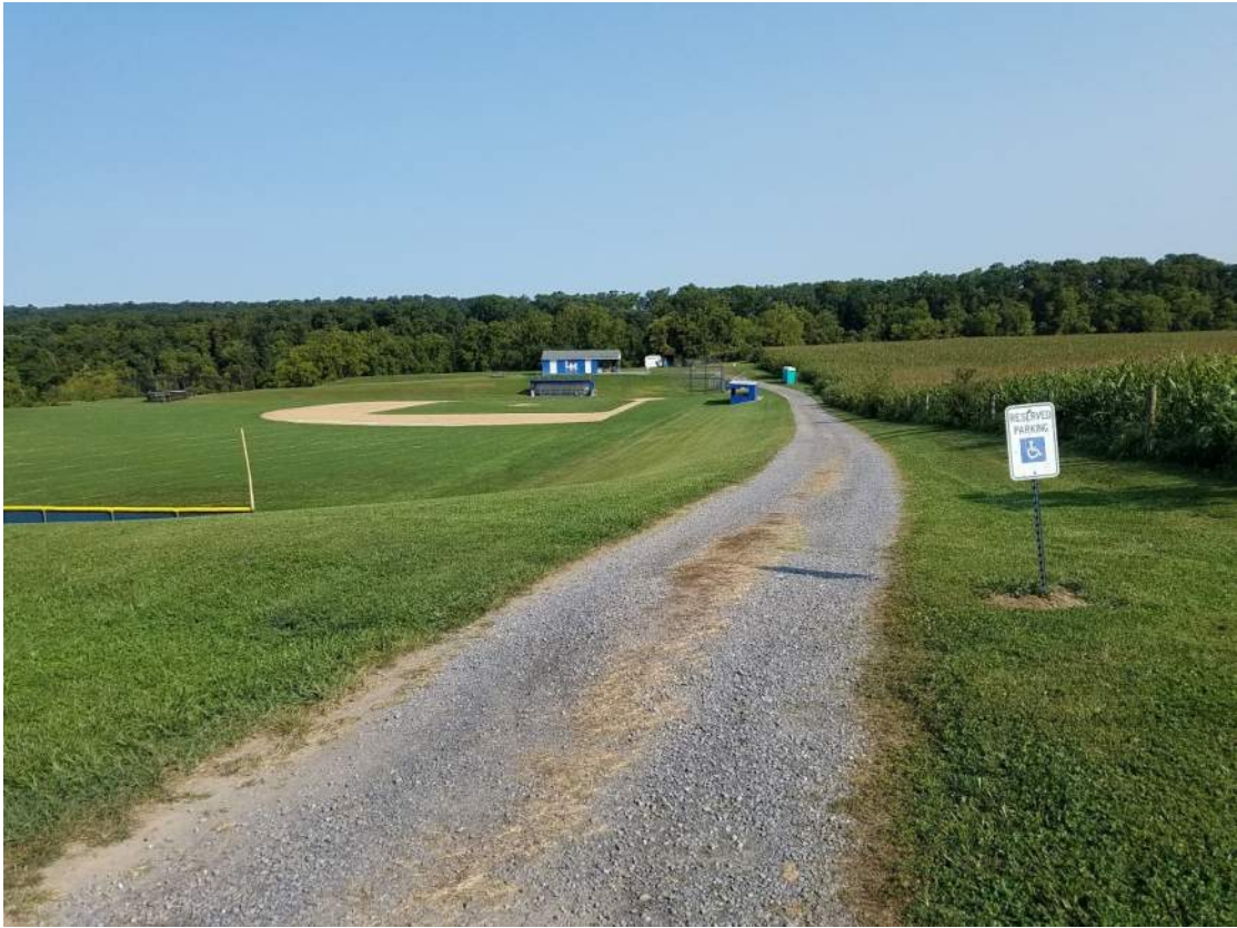
Figure 1: Stone access drive