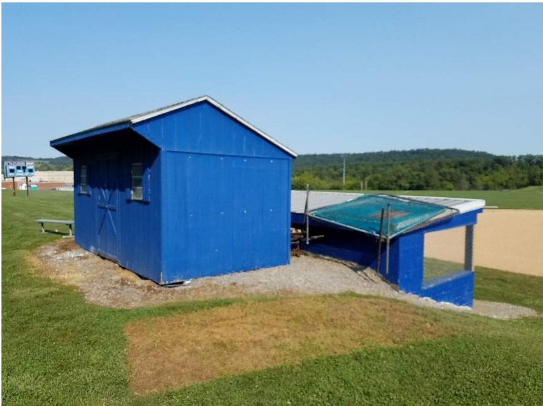
Figure 8: Storage shed and dugout