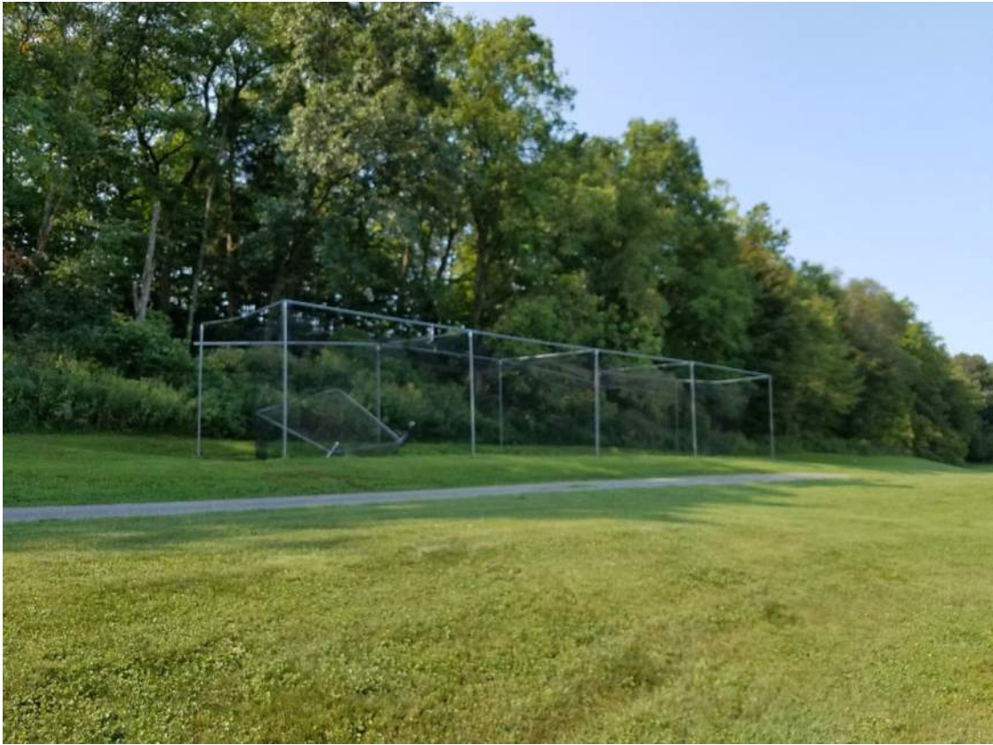
Figure 3: Batting cage