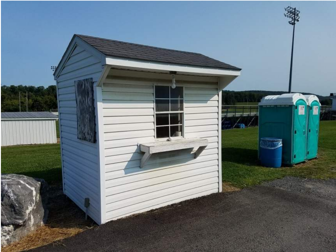
Figure 7: Ticket booth and portable toilets