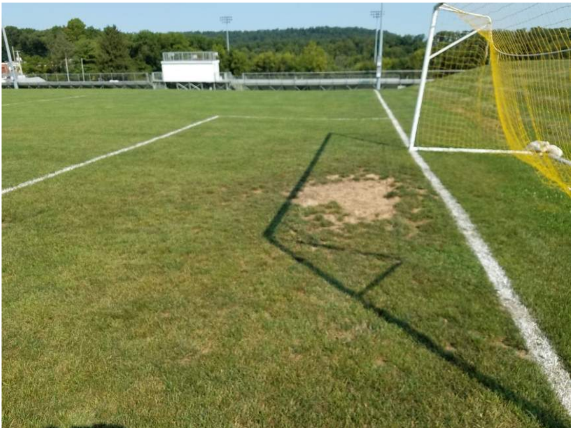
Figure 2: Goal mouth surface condition