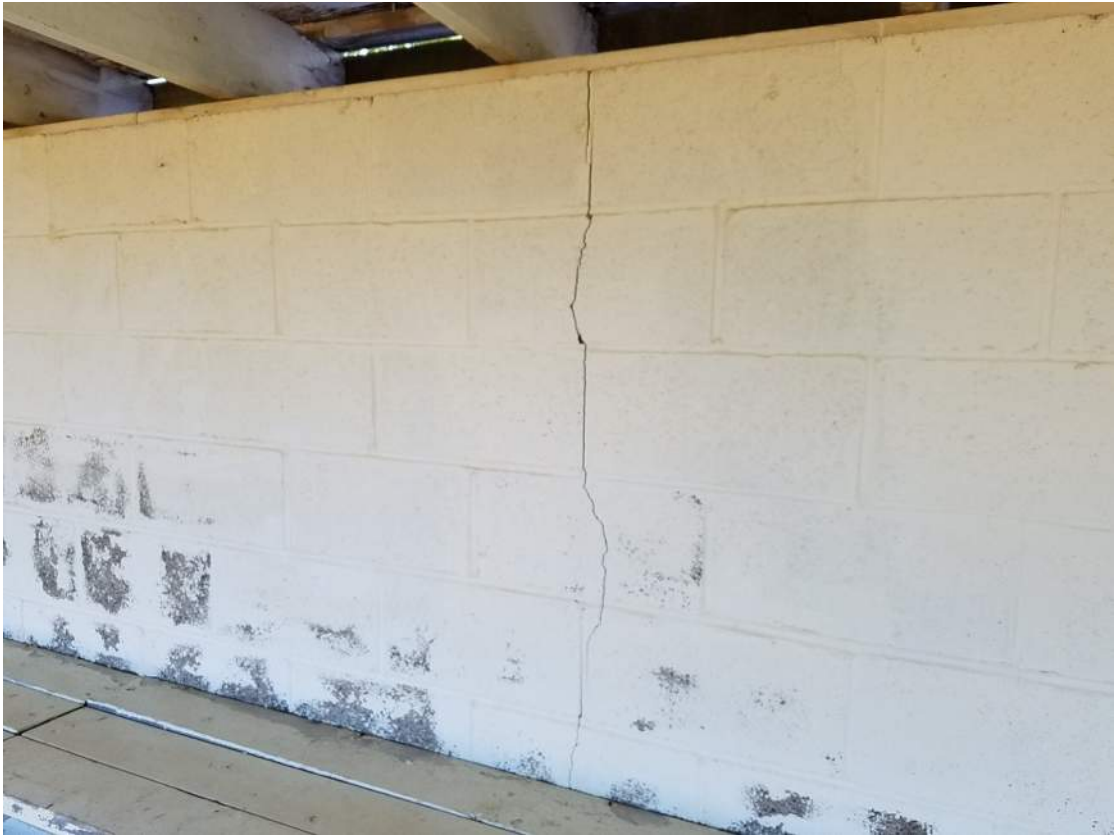
Figure 5: Structural cracking in dugout