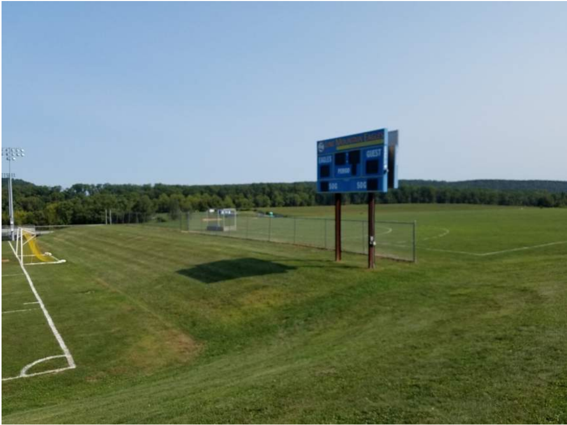
Figure 1: East embankment and scoreboard