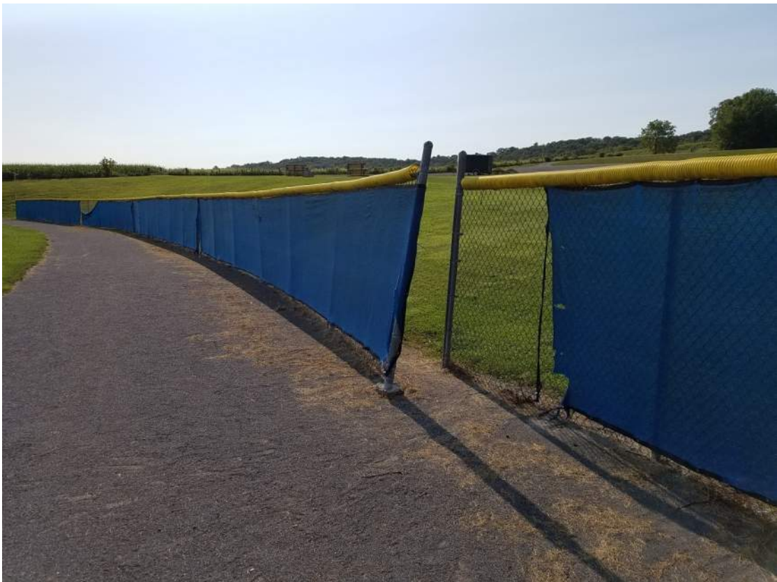
Figure 4: Offset gap in outfield fence