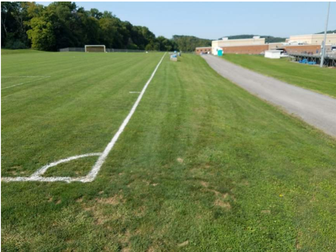
Figure 4: North embankment, stone access drive, and limited sideline area