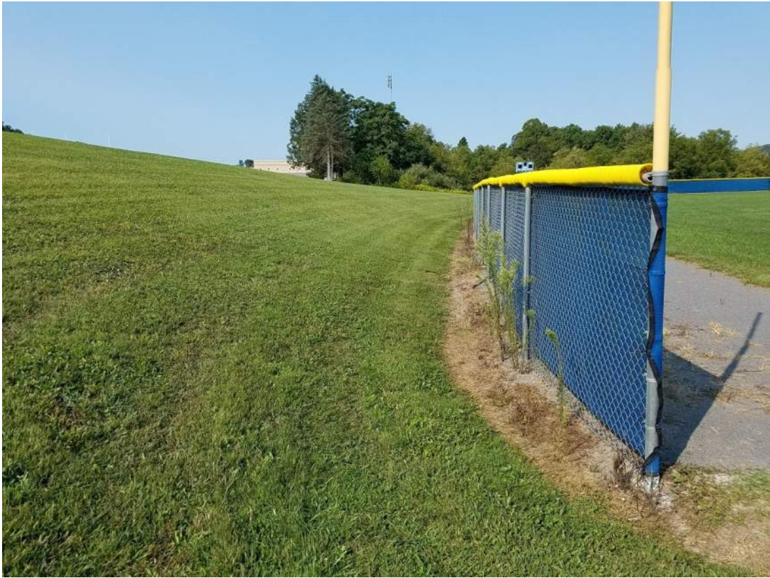
Figure 9: Base of outfield embankment