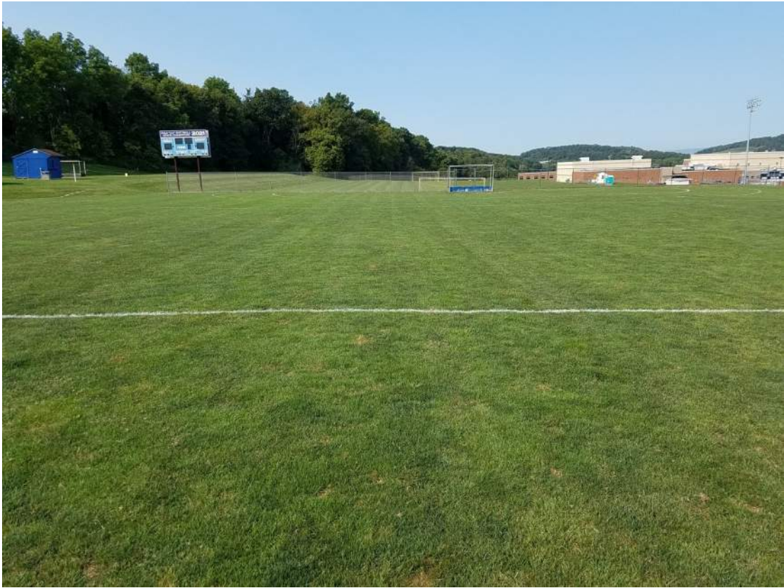
Figure 1: Field Hockey field, Softball outfield