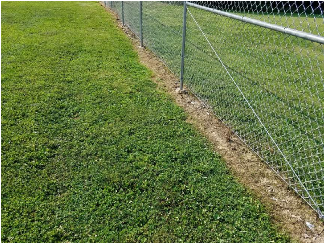
Figure 6: Fence with no bottom rail