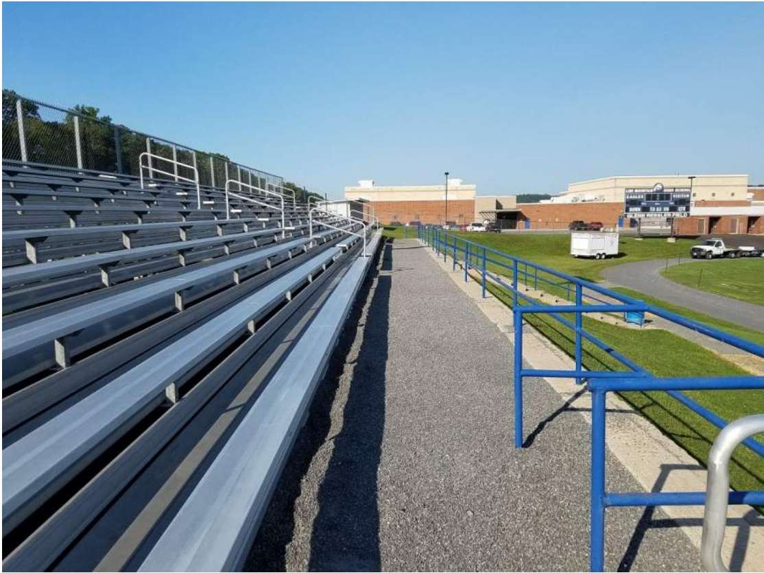
Figure 5: Upper bleachers with stone walk and retaining wall