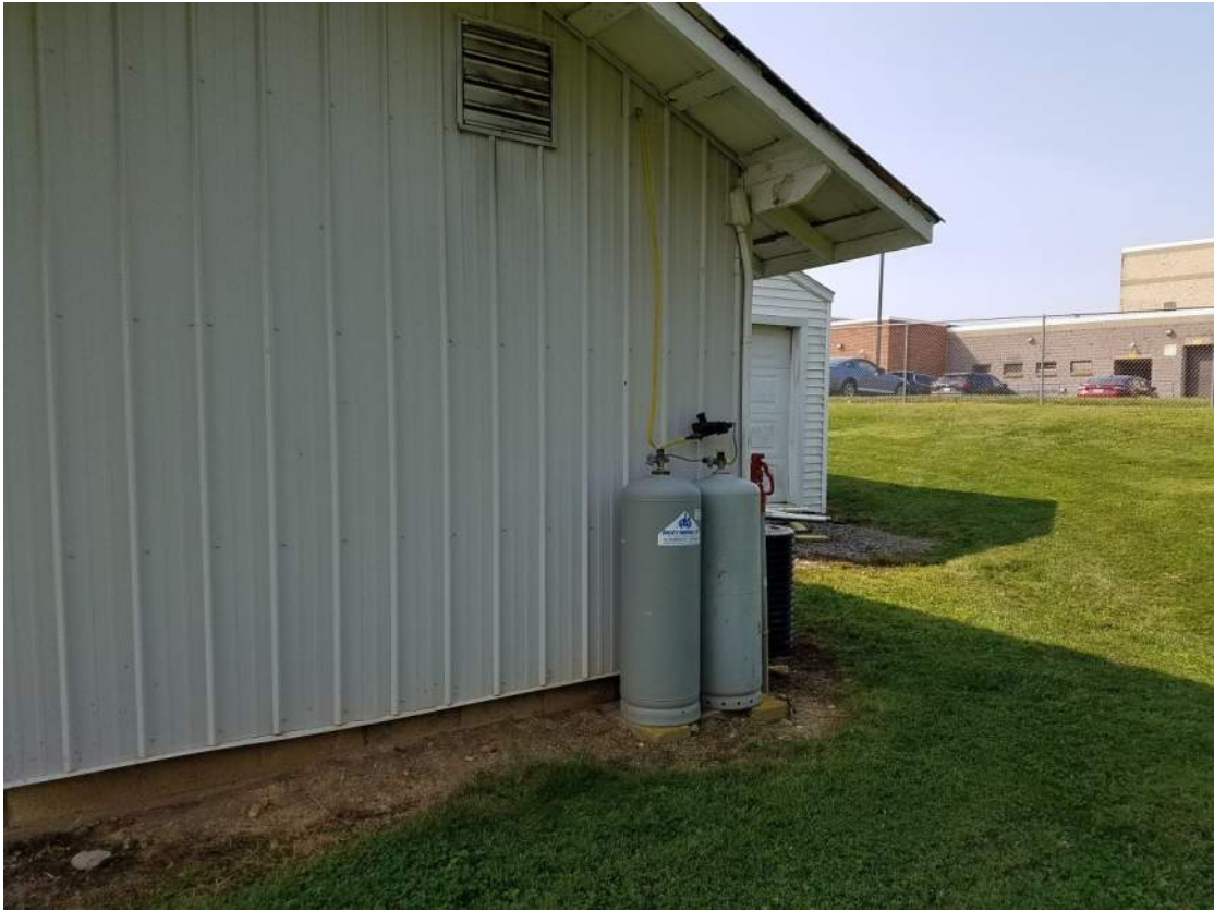
Figure 9: Open access to propane tanks