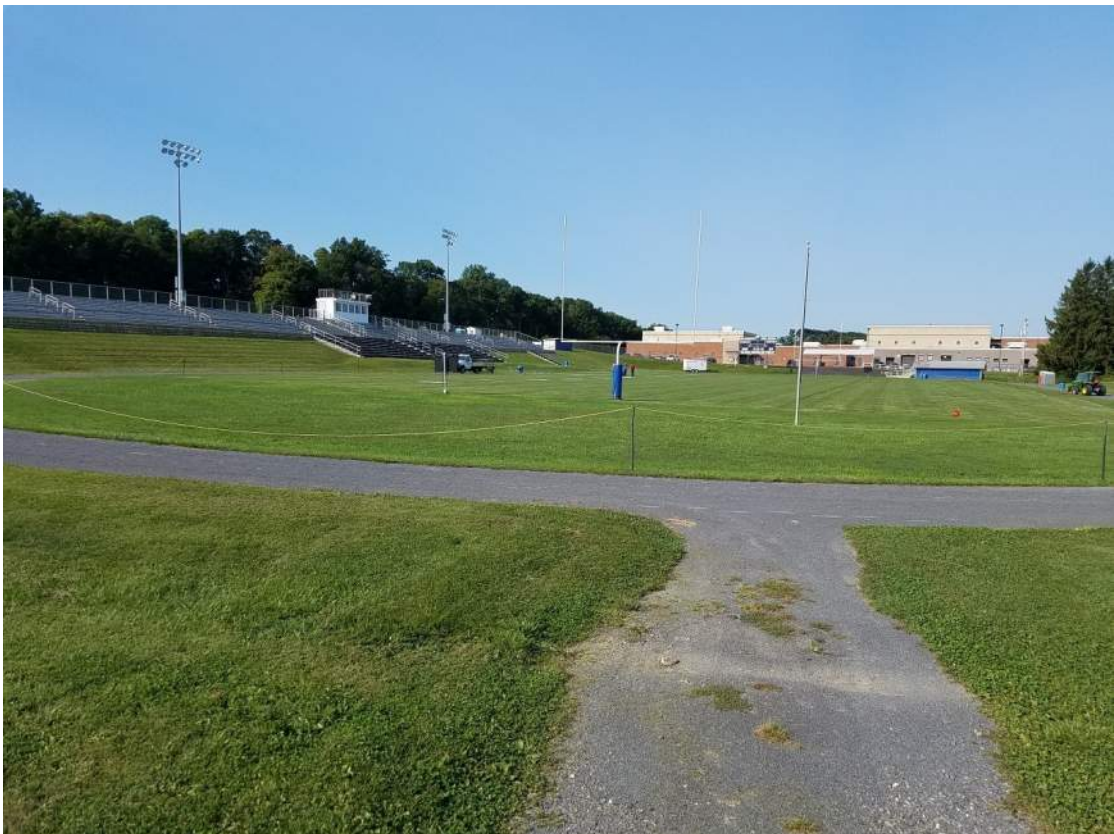
Figure 10: Access to east stone lot, post and rope barrier to field