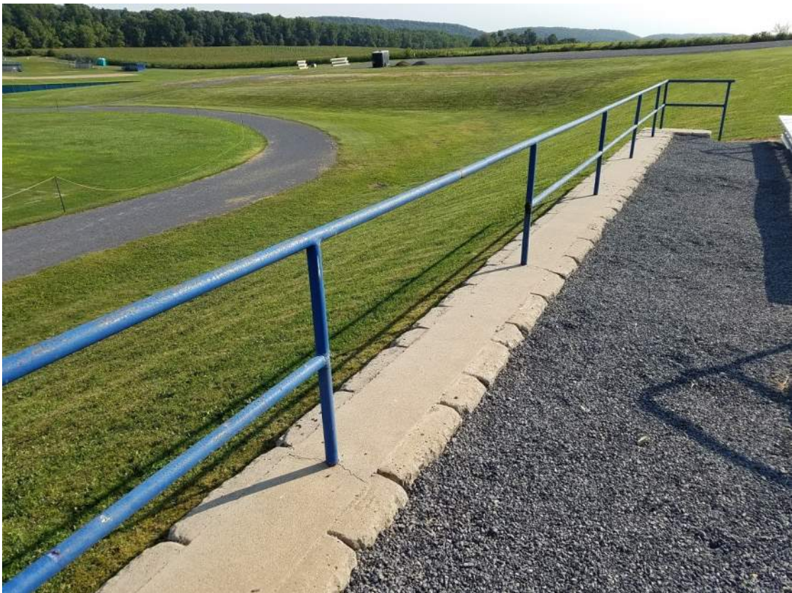
Figure 6: Access walk railing with missing segment