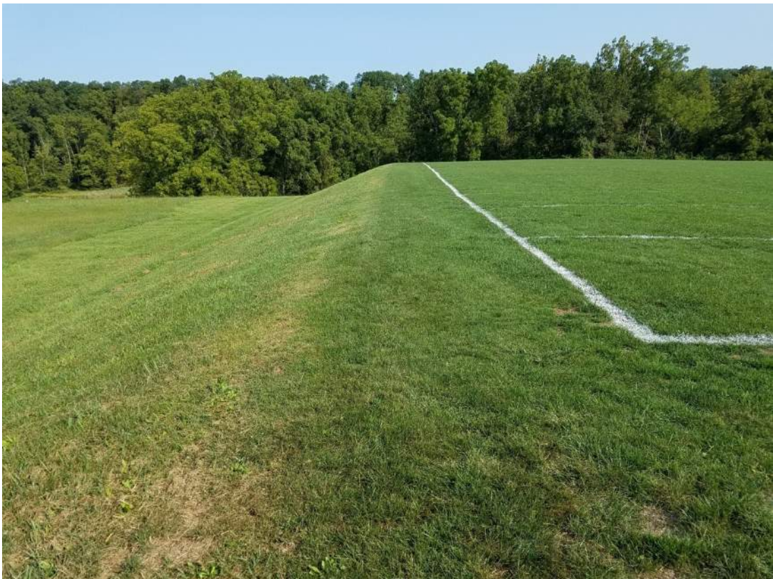
Figure 10: West side slope from practice field