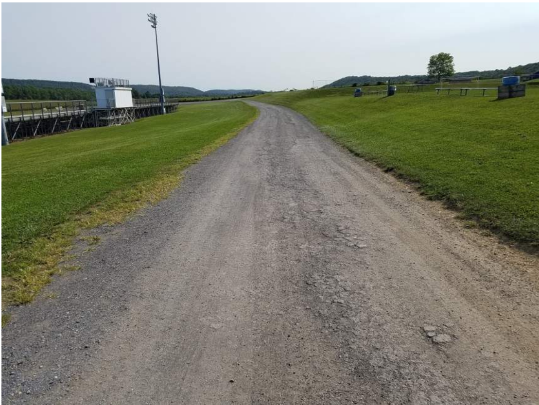
Figure 8: Stone access drive and north embankment