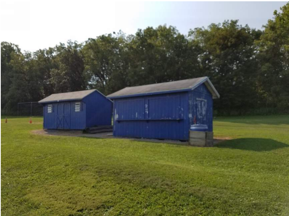
Figure 2: Support buildings