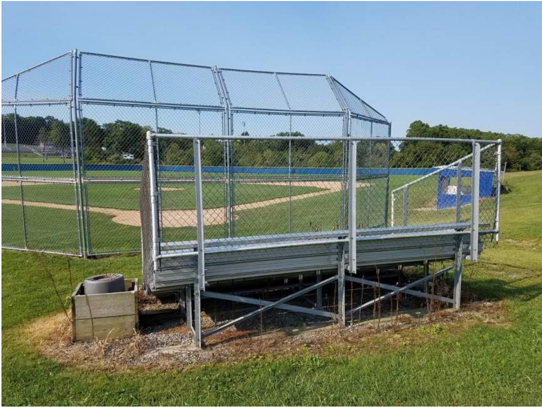
Figure 3: Spectator seating and backstop