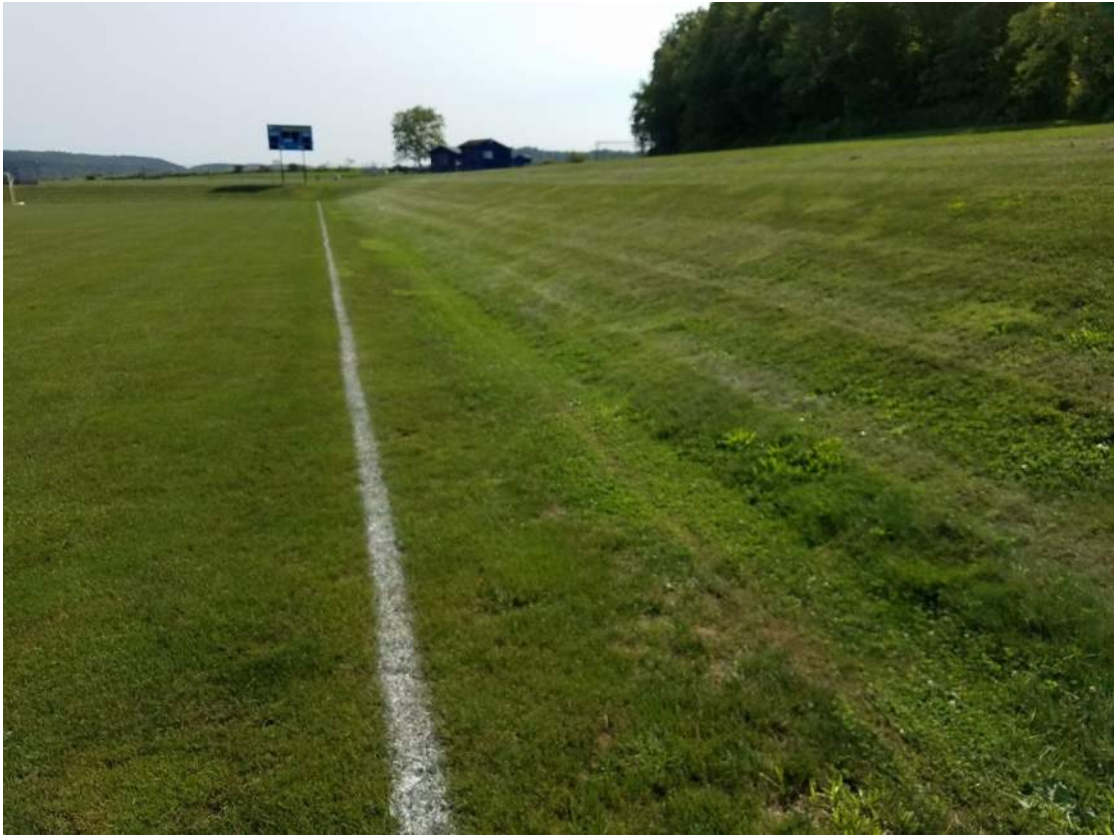
Figure 3: South embankment and limited sideline runoff