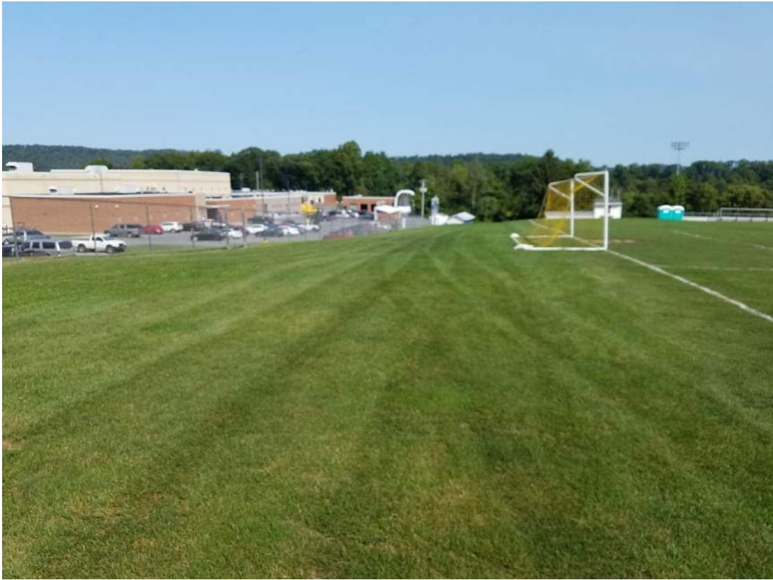
Figure 5: West embankment and perimeter fence