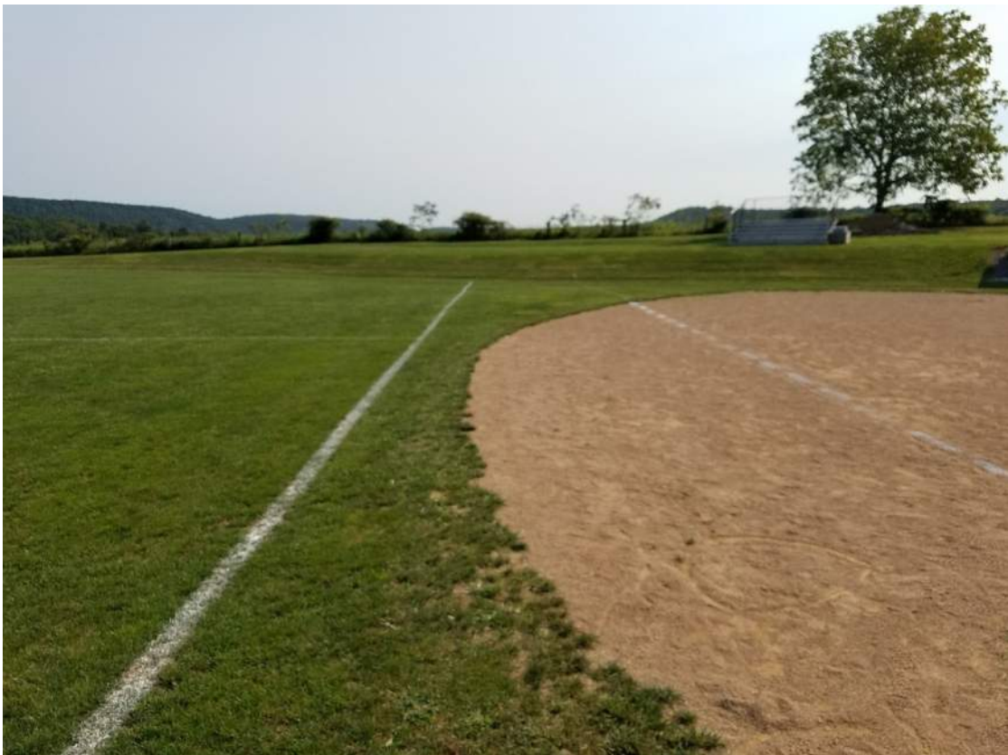
Figure 6: Field Hockey sideline and infield edge