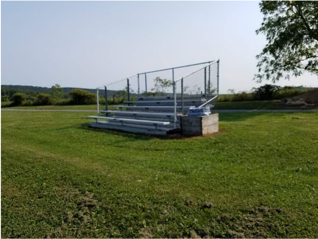
Figure 7: Spectator seating