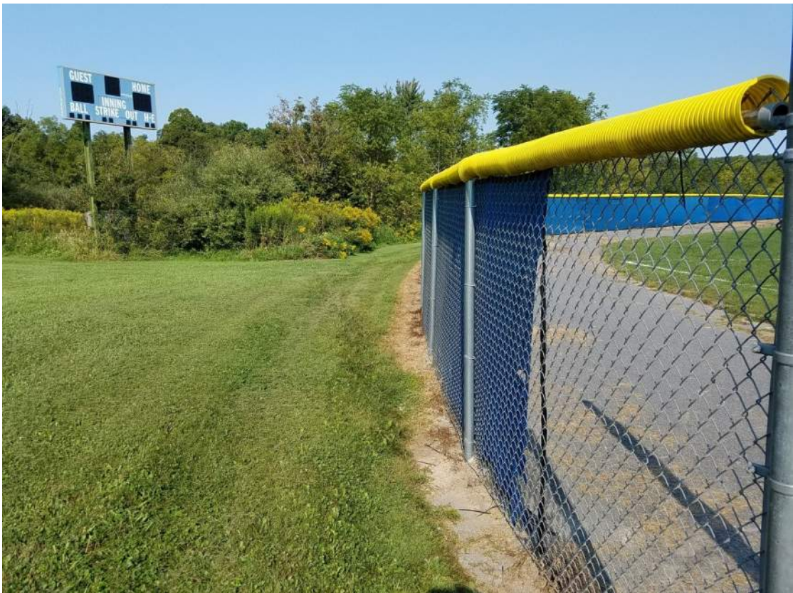
Figure 6: Outfield fence condition, and scoreboard