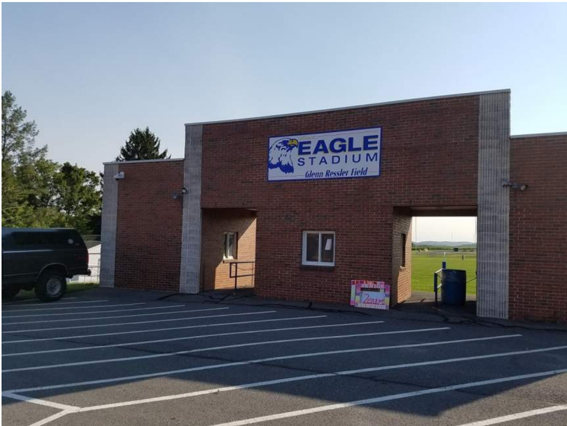
Figure 1: Unsecured Stadium entry