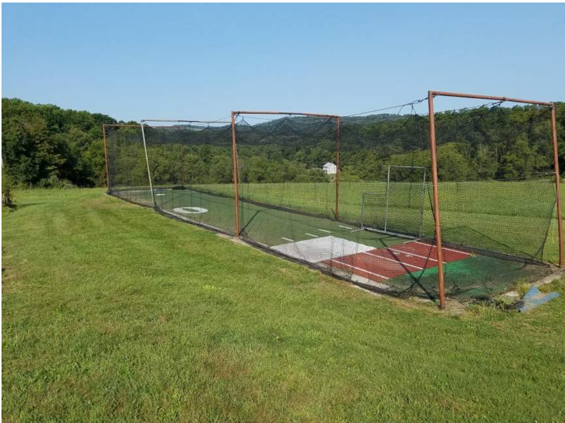
Figure 8: Batting cage condition