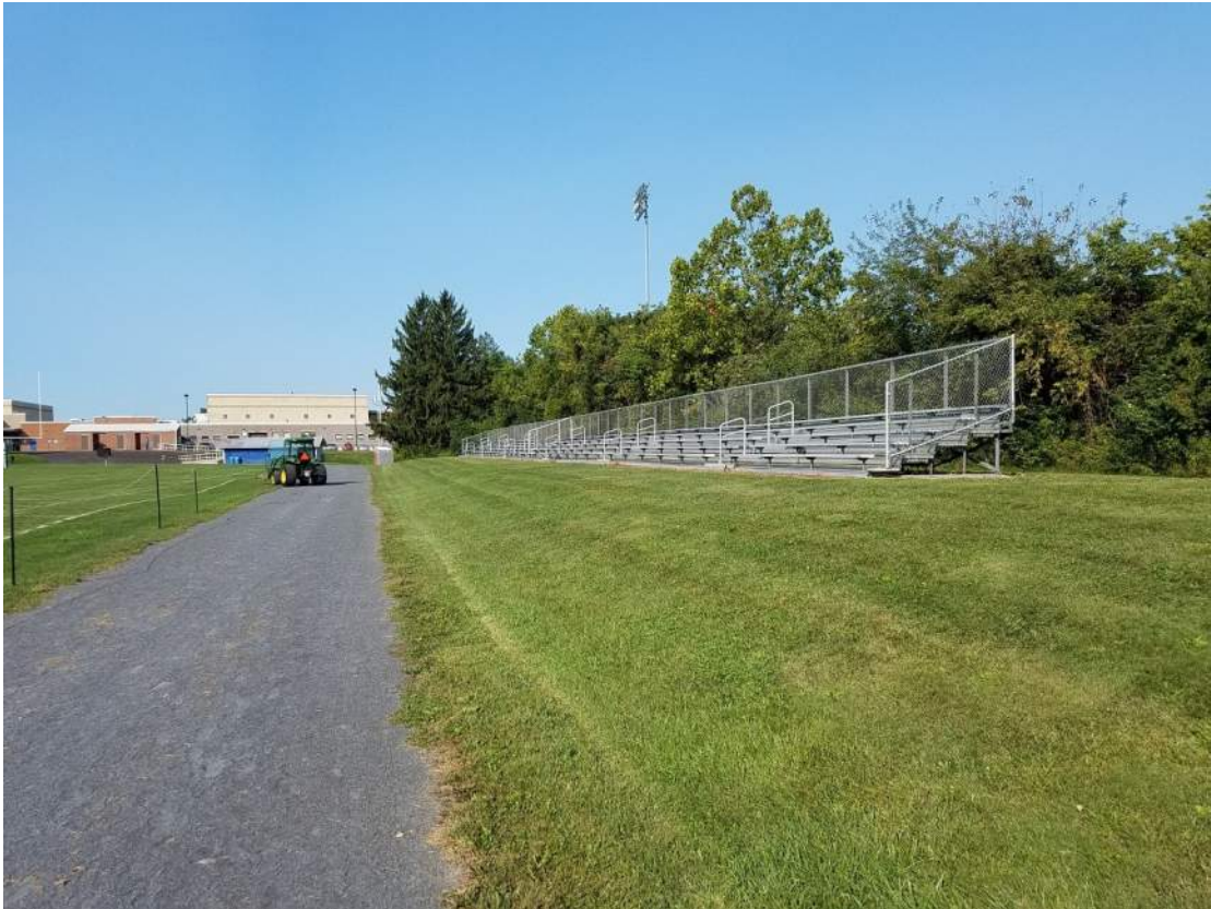
Figure 7: Visitor bleachers with no formal access