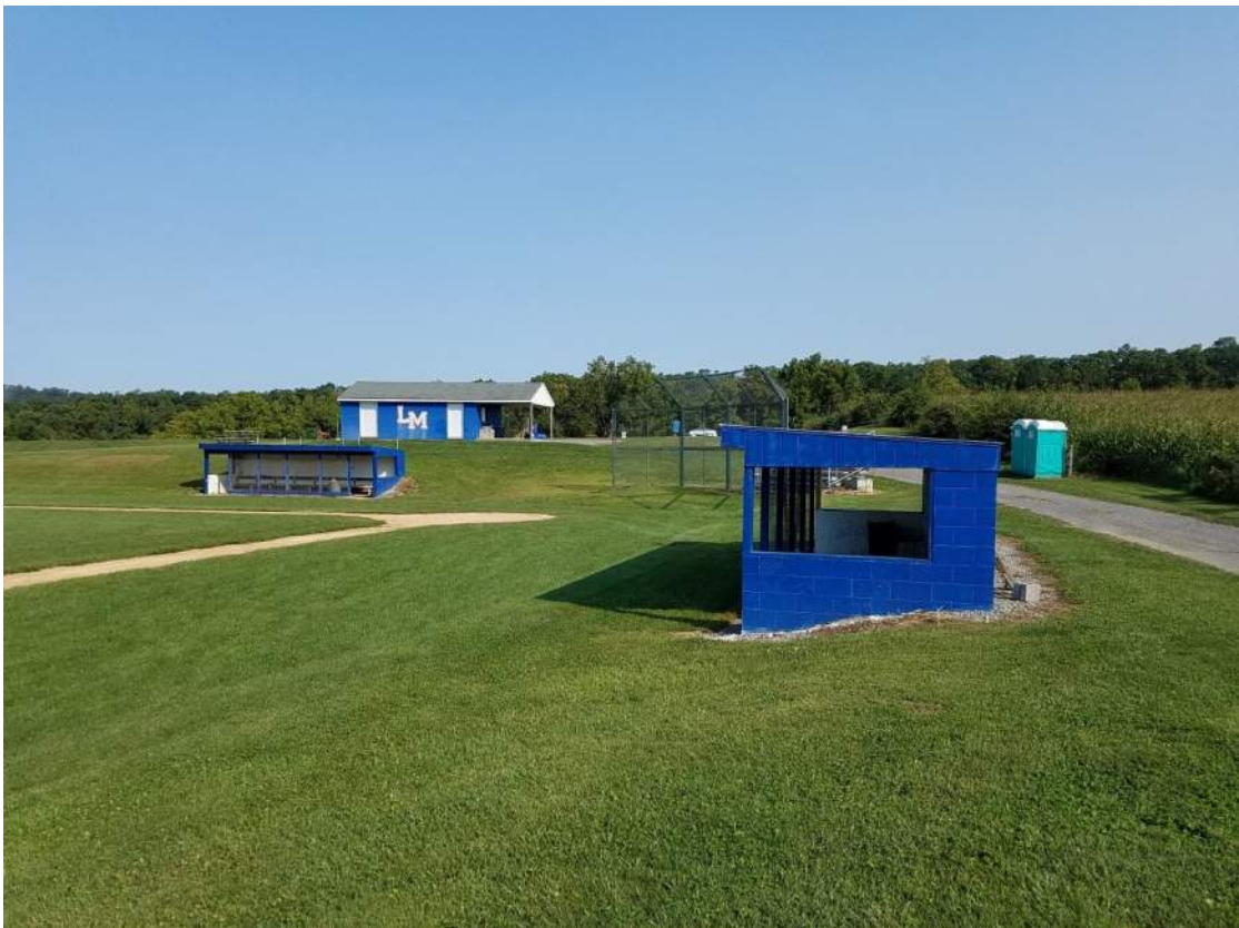
Figure 2: Block Dugouts, Backstop, and support building