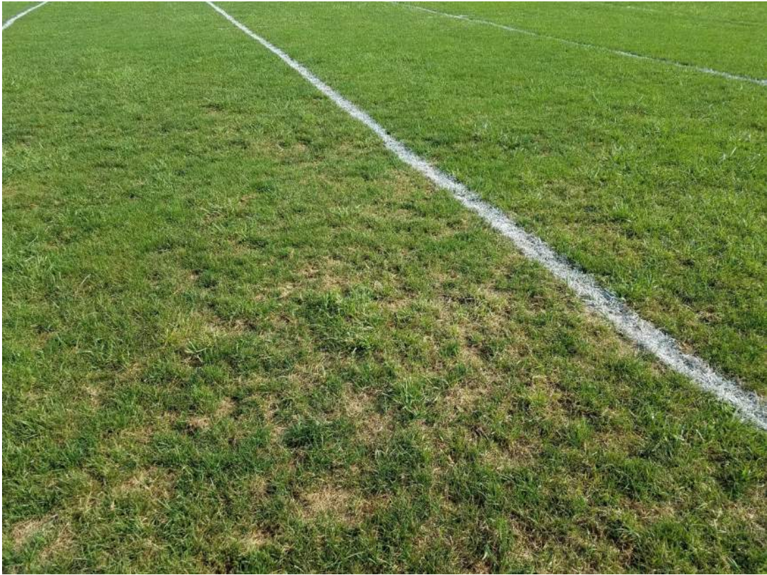
Figure 5: General grass surface condition