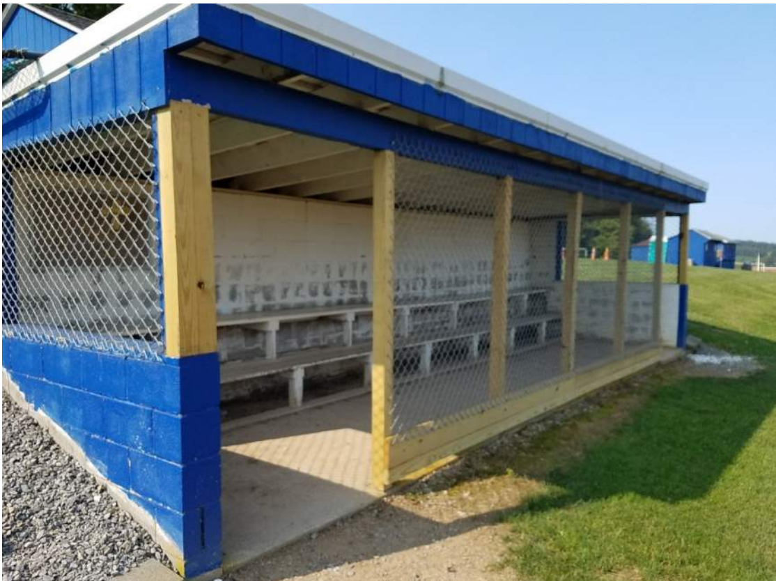
Figure 4: Softball dugout with recent repairs